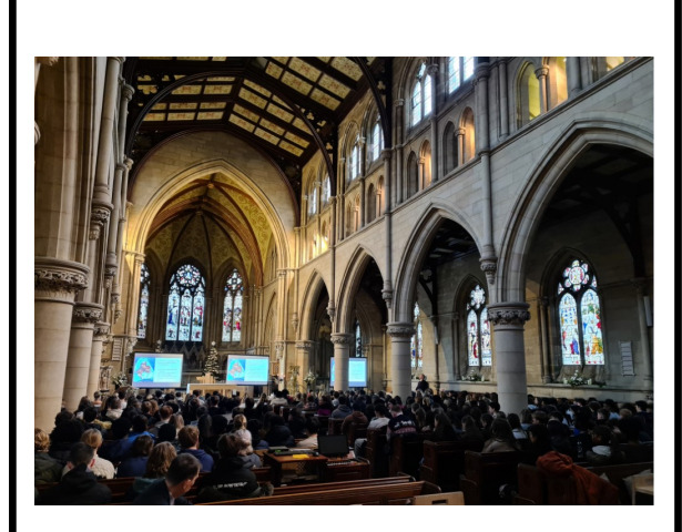
Above Picture: Advent Service in St John's Church, Ranmoor